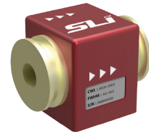
Custom Wavelength Selector