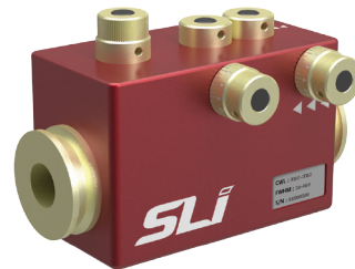
High Resolution FWS