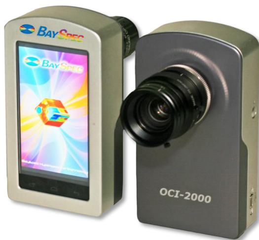
OCI-2000™ Handheld Snapshot Imager